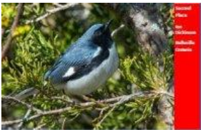
Second Prize: Ian Dickinson

A big thank you to the committee and all our wonderful volunteers who helped make the Spring Birding Festival a great event. We welcomed hundreds of visitors from far and near to observe the spring migration. The weather was sometimes cool and wet, and flooding along the lake made it impossible to reach the lighthouse, but all events went ahead as planned. Members completed the Great Canadian Birdathon, PEC Field Naturalists led hikes around the County and the Big Day in the IBA counted more than 120 species. A few rarities also showed up (Fish Crow, Yellow-breasted Chat) to be added to life lists. Thanks also to our bander David Okines and assistant Jacques Turner-Moss for demonstrating banding operations at the Observatory.