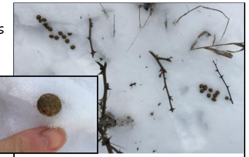
Rabbit scat is round. Clusters of rabbit droppings and nipped twigs are signs of rabbit visitors.

s in all sizes and shapes. The food an animal eats (its diet) and the size of the organs in its digestive tract affect the size and shape of the droppings. Deer are large animals but have a small colon opening (part of digestive tract). Their droppings are small and often confused for Rabbit scat.