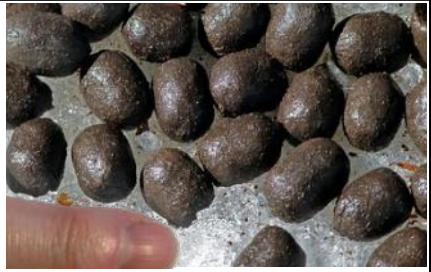
Deer drop small oval pellets in a large cluster in more open spaces.

Size and Shape— Scat comes in all sizes and shapes.