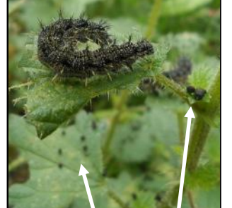
Little dark droppings on leaves may be from a caterpillar.