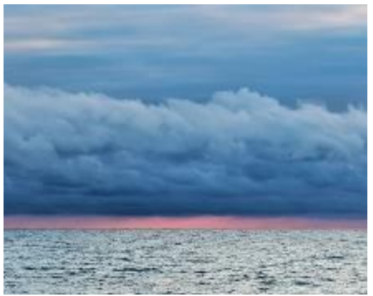
(Viceroy) (Lake Ontario)