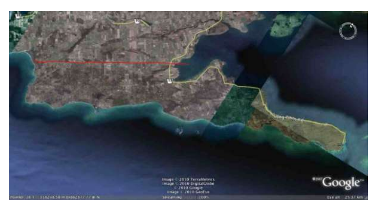
Figure 1: PECSS IBA