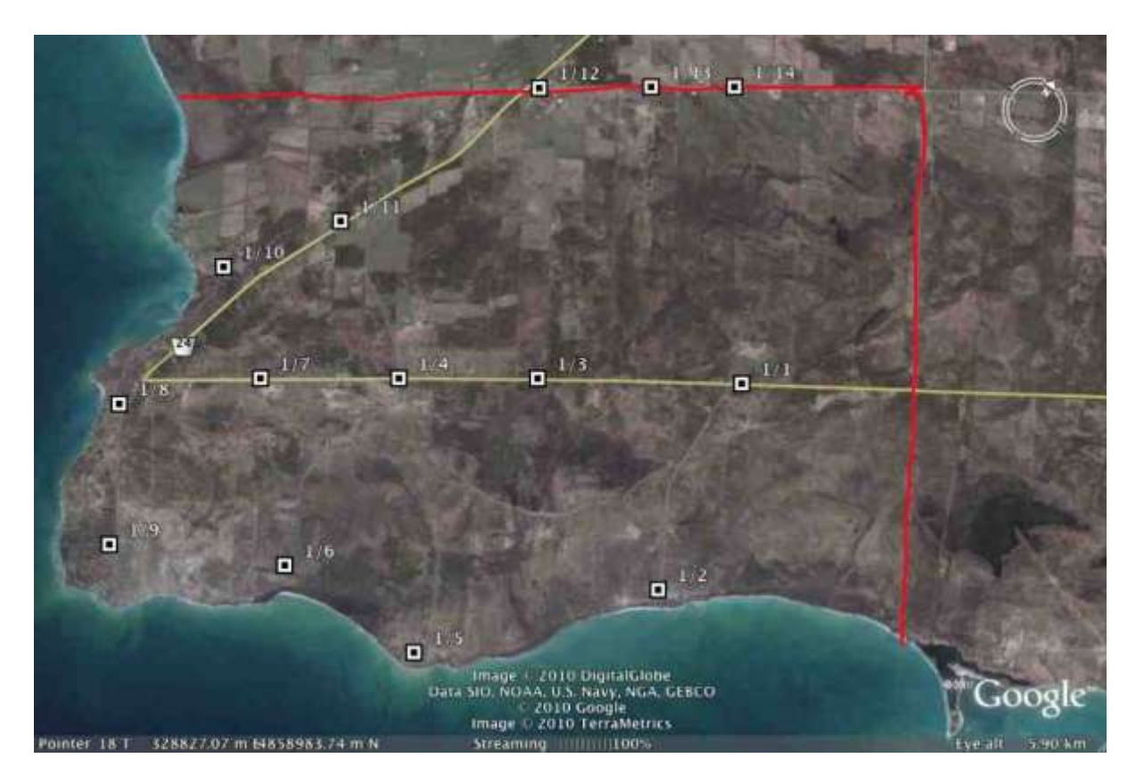
Figure 2: Location, stops and boundaries of section 1