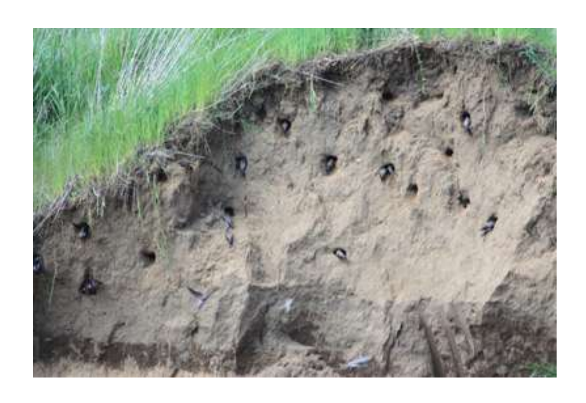
Bank Swallows