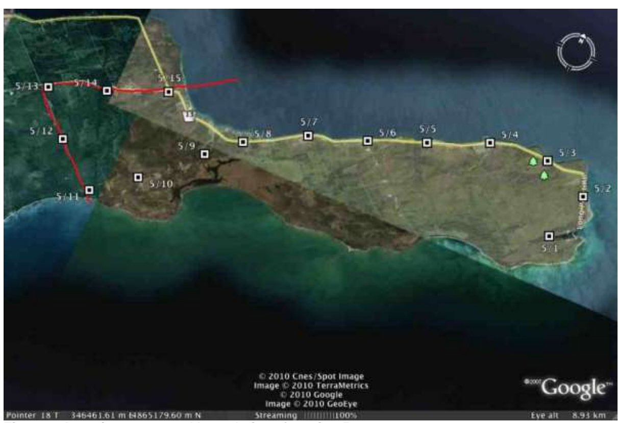
Figure 6: Location, stops and boundaries of section 5

An early morning visit (05:00 to 10:00) was made to each stop. An evening visit (17:00 to 21:30) was carried out for the evening crepuscular activity before the birds went to sleep for the day. In June, a nocturnal visit (after sunset with a full moon, between 1<sup>st</sup> and last quarter and under favourable weather conditions) was also carried out at all stops to detect crepuscular and nocturnal bird activity, particularly Whip-poor-will. A second round of visits occurred at least 10 days after the first visit. Birds were surveyed using fixed-point counts at one-kilometre intervals along the existing roadways and tracks, as described below. Incidental observations of significant and unusual species observed during visits were also recorded. In addition to the ten target species, observations were also taken on 12 other species that will be coming up for review in the future.