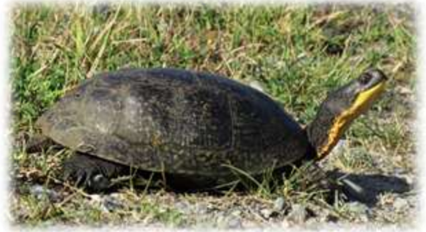
Blanding's Turtle