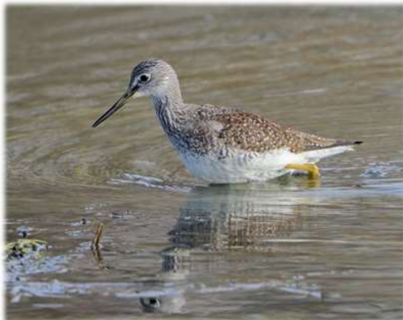
Greater Yellowlegs (Ian Barker)

Using the IBA Protocol on eBird, PEPtBO organized a modified fall Waterfowl Count in 2020. Volunteers also surveyed land birds along the routes to the waterfowl survey points.