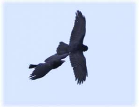
Common Raven