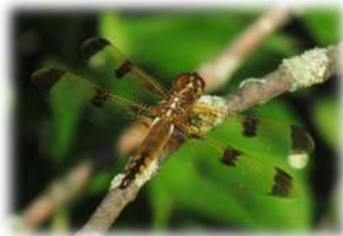
Painted Skimmer

2020 Christmas Bird Count teams (Sandbanks, Prince Edward County) Kingston Field Naturalists, Prince Edward County Field Naturalists eBird list contributors