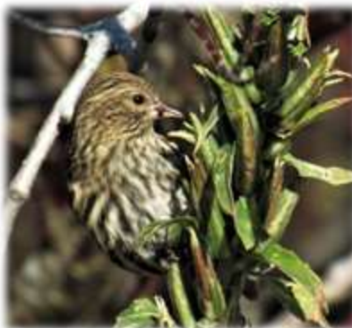
Pine Siskin