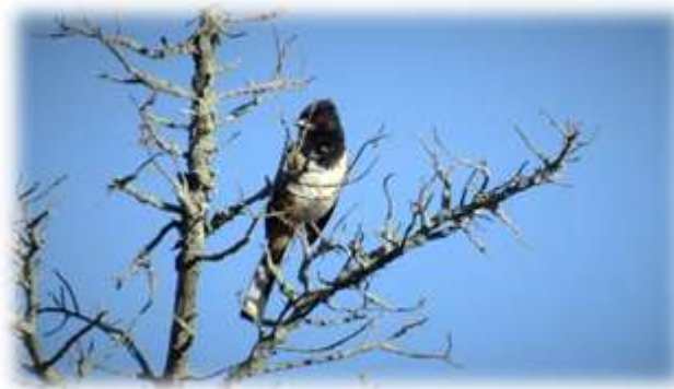
Eastern Towhee (Peter Fuller)